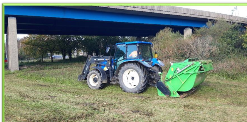
Collaborative working between departments removing the arisings to maintain healthy meadows