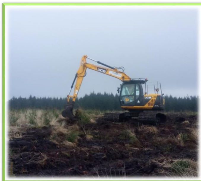
Ground smoothing techniques to restore functioning peatland

Sct. 7 (1) The Welsh Ministers must prepare and publish a list of the living organisms and types of habitat which in their opinion are of principal importance for the purpose of maintaining and enhancing biodiversity in relation to Wales.