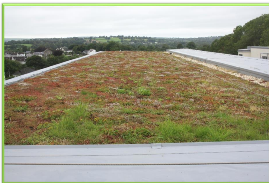
Living roofs can be used to mitigate habitat loss, stabilise heating and sound within a building and contribute to decarbonisation