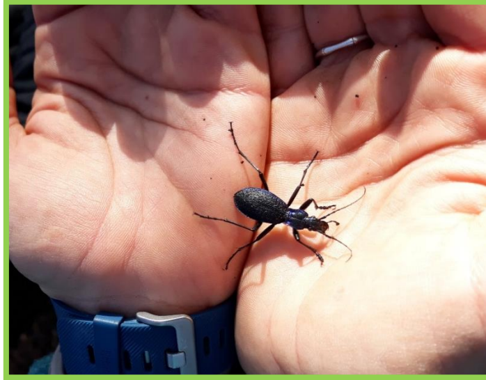
Blue Ground Beetle

3.6 Our woodlands provide a home to the rare Honey Buzzard. This bird of prey specialises in eating wasp grubs. It is a very scarce breeder in the UK and the Neath population is well known and studied. Recently a population of Blue Ground Beetles was discovered in ancient woodland in Skewen. This is the only site where they have been found in Wales. Spectacular displays of Bluebell carpets can be seen each spring in many of our ancient woodlands.