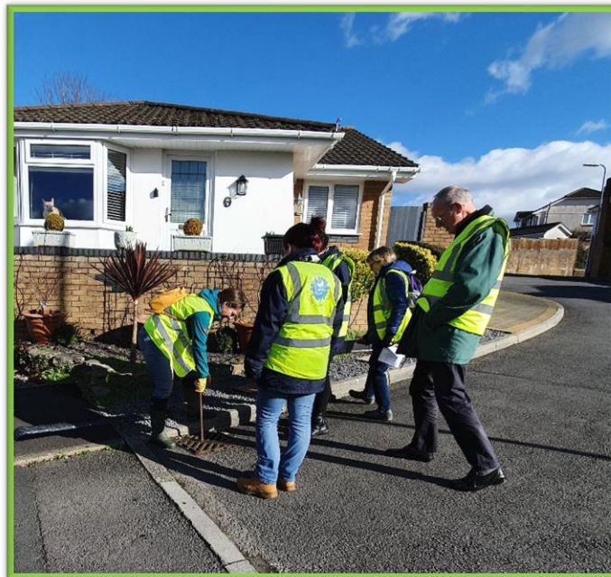
Working with communities to protect vital animal corridors – toad ladders

5.11.5 Part 2 of the NRAP (updated 2020) sets out an action plan, with a number of actions allocated to Local Authorities as key partners for delivery.