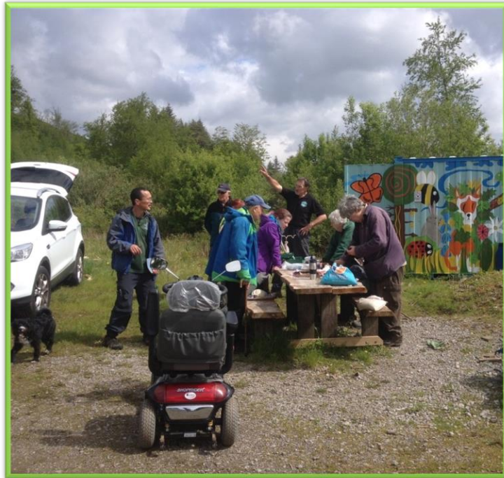
Volunteering at a Country Park

‘Value our green infrastructure and the contribution it makes to our well-being’