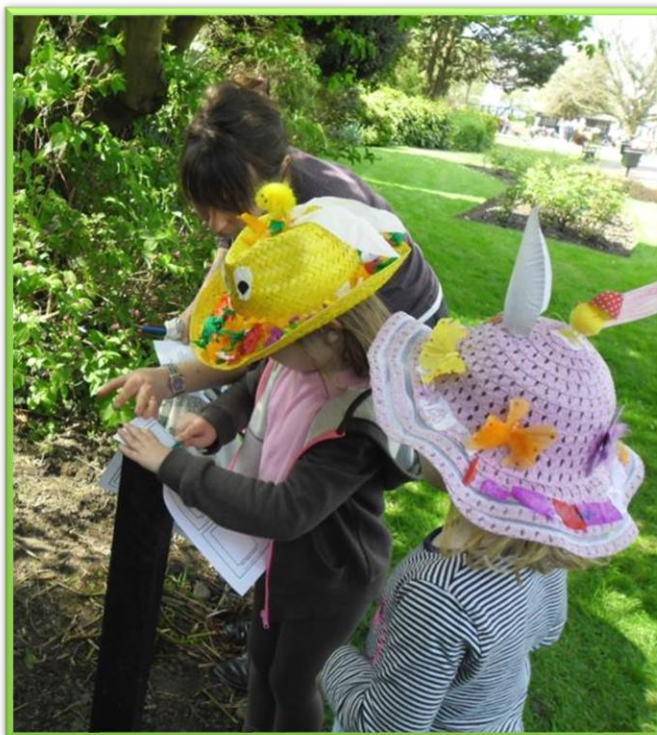
Wildlife explorer trail engaging children with the natural world

5.10.4 Our actions relating to awareness raising, green infrastructure and the NPT Nature Recovery Action Plan will aim to allow people to become familiar with the natural world around them. They will encourage interaction and appreciation of natural resources and habitats.