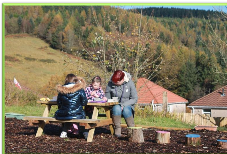
Spending time in nature improves our physical and mental wellbeing